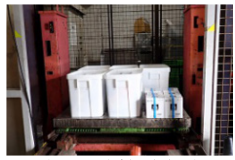
Waste products waiting to be fed into the disposal process (on-site check)

We are present on-site to oversee commissioned waste disposal for products being discarded.