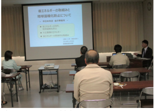
A lecture on preventing global warming

We have also been continuously providing environmental training at the head office and branch offices. During FY2018, training on the environment was held in November at the Nakanihon Branch's Kanazawa Office in Kanazawa City. In this fiscal year, training was held on the effort to reduce energy usage and the necessity of preventing global warning. Training on the environment will continue going forward while striving to raise employees' awareness of the environment and legal compliance.