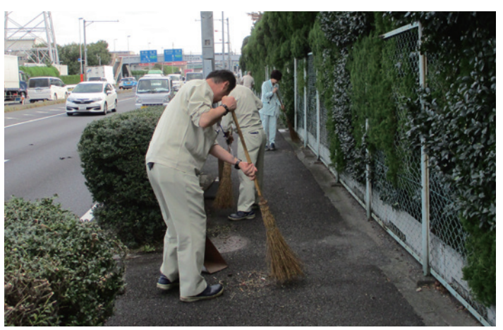
Cleaning activities around the Omiya factory

[Production Department] Participants: 921 people (including the workers' families)