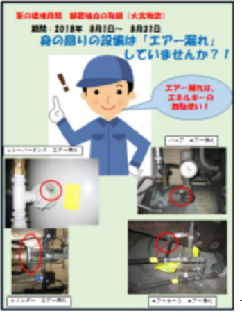
The Logistics Dept. made an original poster