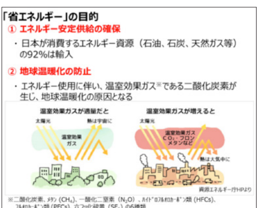
The effort to save energy