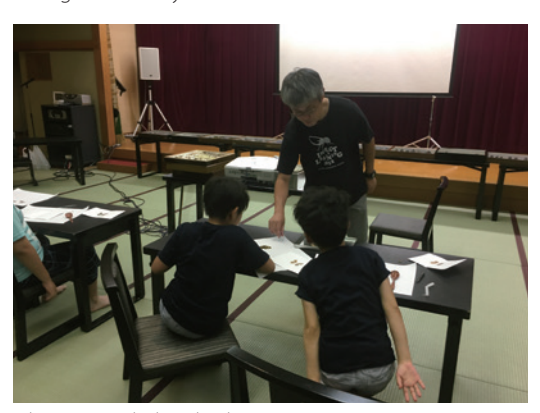
A lesson to teach about biodiversity

By explaining the academic significance of this discovery in a way that is easy to understand, we are bringing awareness to what little we know about the animals that coexist nearby, and deepening our understanding of biological diversity.